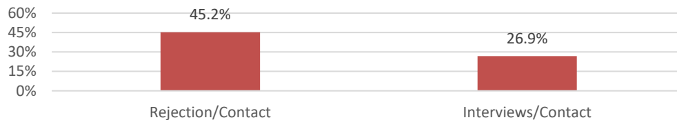
Rejection rate and Interviews per Contact North Macedonia ES, 2019

Details on the rejection rate, eligibility rate, and item non-response are available at the level strata. This report summarizes these numbers to alert researchers of these issues when using the data and when making inferences. Item non-response, selection bias, and faulty sampling frames are not unique to North Macedonia. All enterprise surveys suffer from these shortcomings, but in very few cases they have been made explicit.