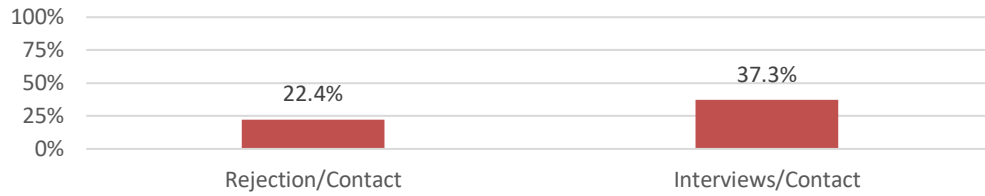
Rejection rate and Interviews per Contact Armenia ES, 2020

Details on the rejection rate, eligibility rate, and item non-response are available at the level strata. This report summarizes these numbers to alert researchers of these issues when using the data and when making inferences. Item non-response, selection bias, and faulty sampling frames are not unique to Armenia. All enterprise surveys suffer from these shortcomings, but in very few cases they have been made explicit.