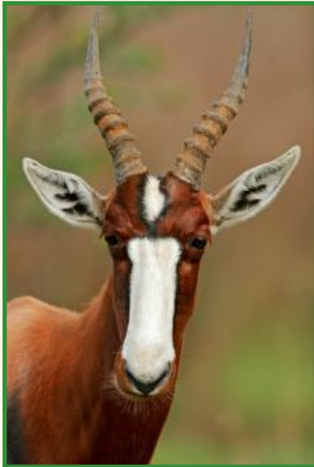
Antelope 95 kph

An antelope can run as fast as a cheetah.