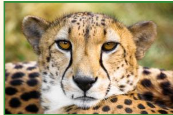
Cheetah 95 kph