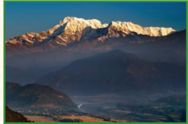
Annapurna – 8,091 m.