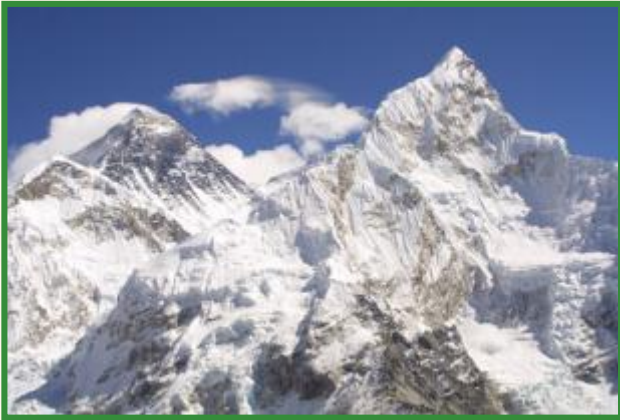
Everest – 8,848 m.

Annapurna is not as high as Everest. Annapurna is n't quite as high as Everest.